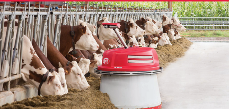
JUNO Feed Pushers