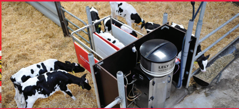
CALM Calf Feeders