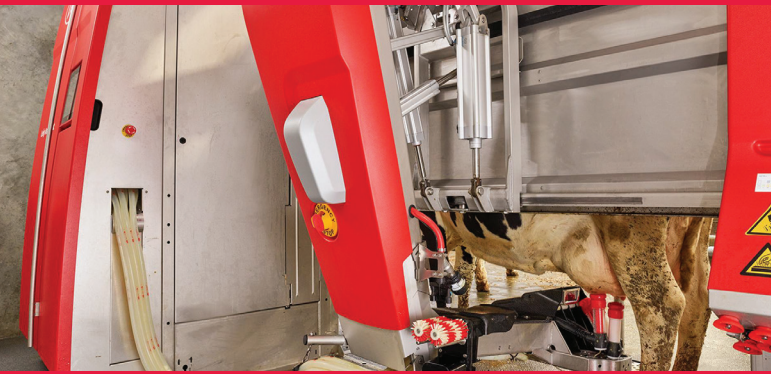
ASTRONAUT Milking Robots